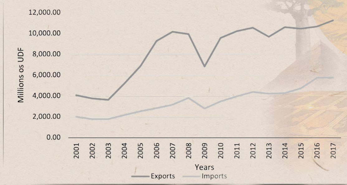
Graph 2. Trade relations with Mexico. Japan 2001 - 2017

Source: Own elaboration made with information from the International Monetary Fund. Retrieved from https://data.imf.org/